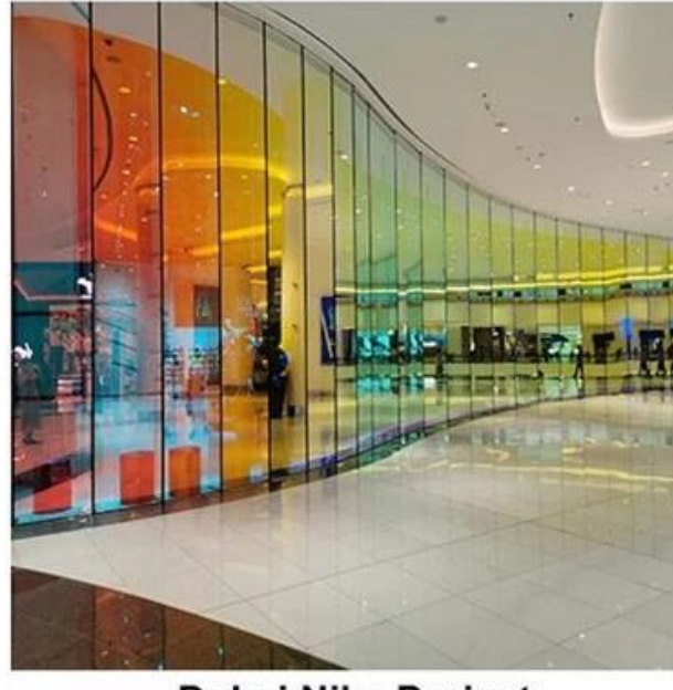
Dubai Nike Project