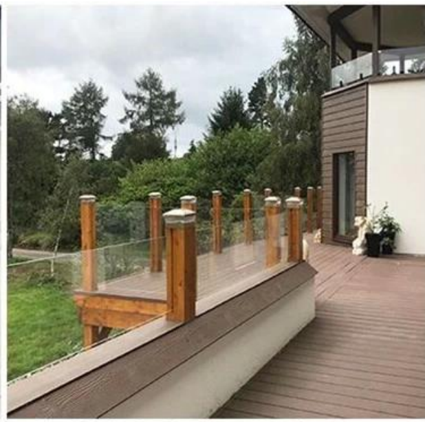
Britain Railing Project