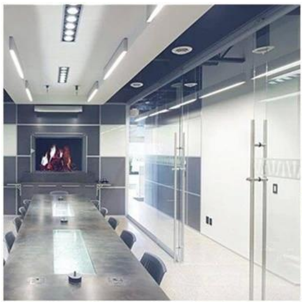
Canada Partition Project