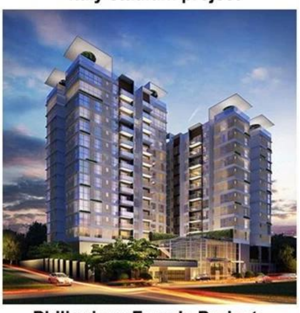
Philippines Facade Project