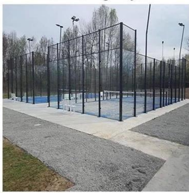
Italy stadium project