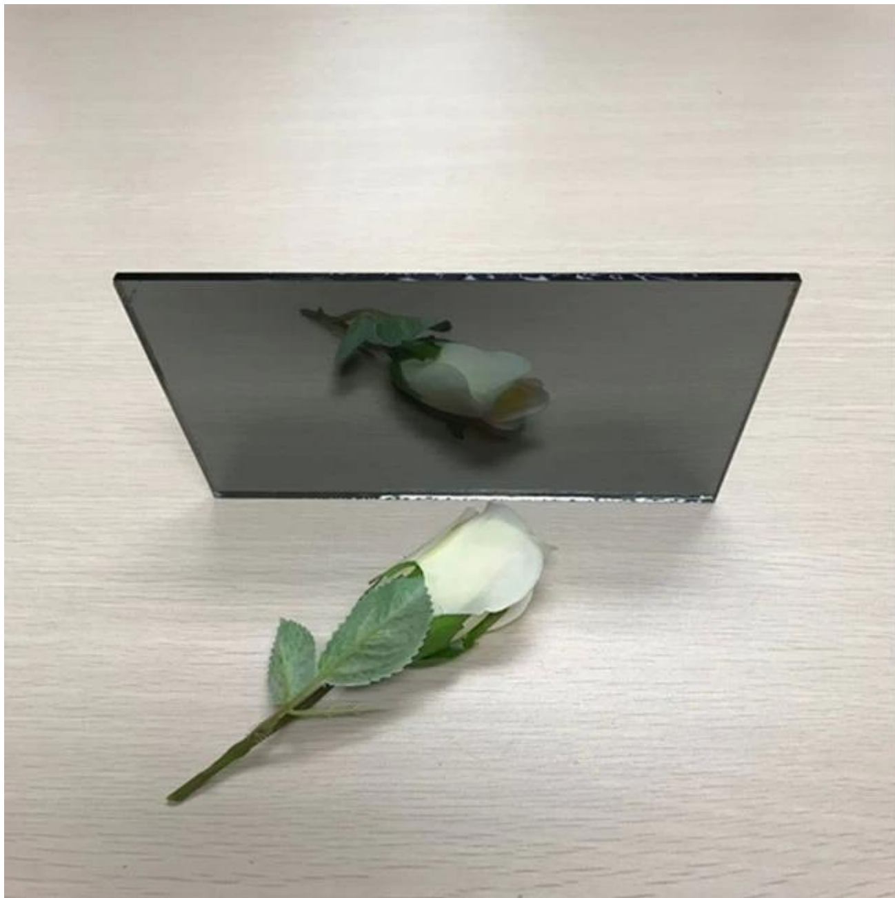
Advanced 4mm grey mirror prodction line