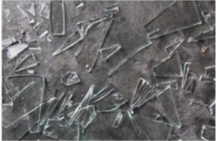
Annealed Glass when broken into sharp, easy to hurt human