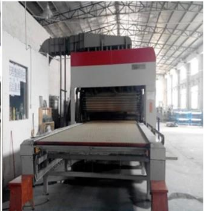
Safety Tempered Laminated Glass stronger Packing and Loading