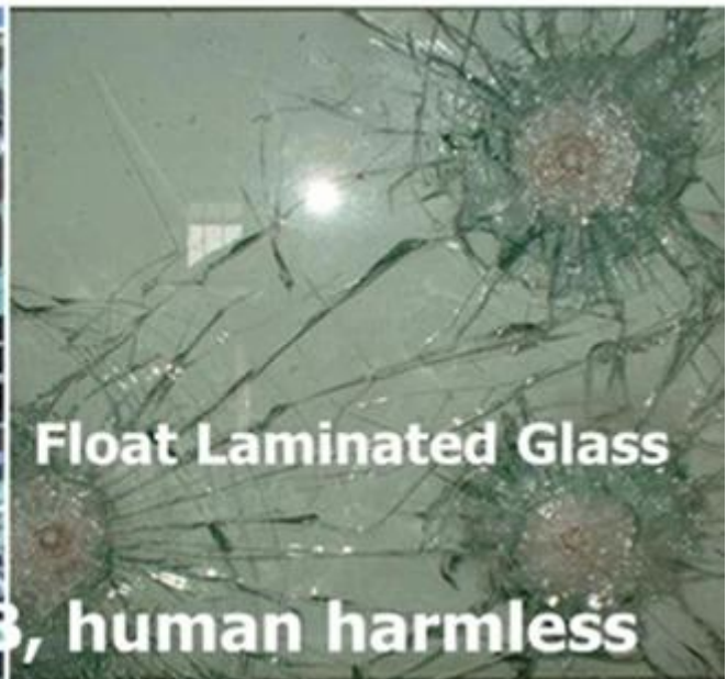
Float Laminated Glass

Safety Tempered Laminated Glass Production Plant