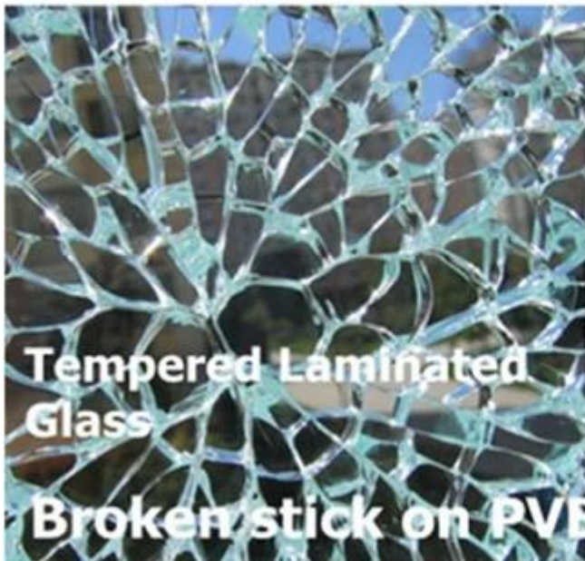
Tempered Laminated Glass