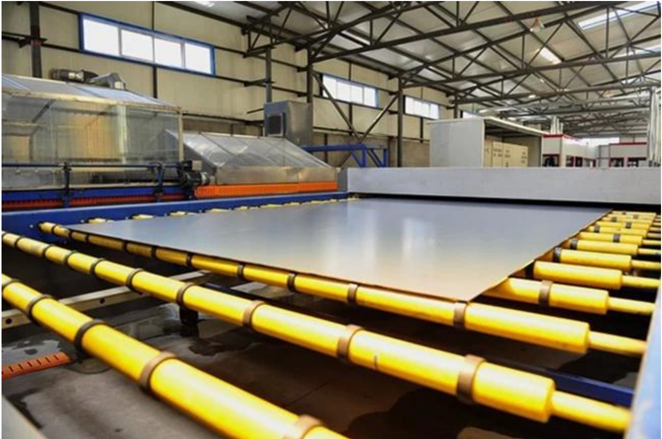
Mirror Safety Packing