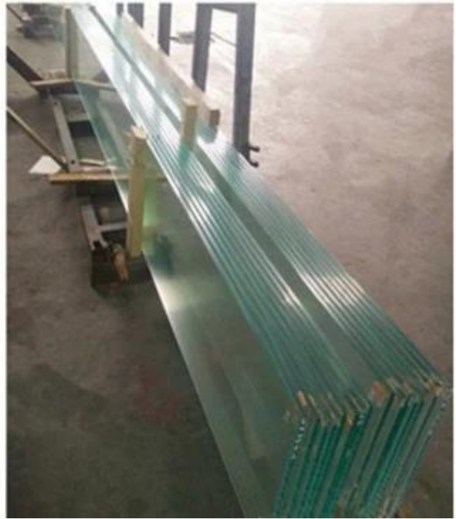
China factory glass fin wall