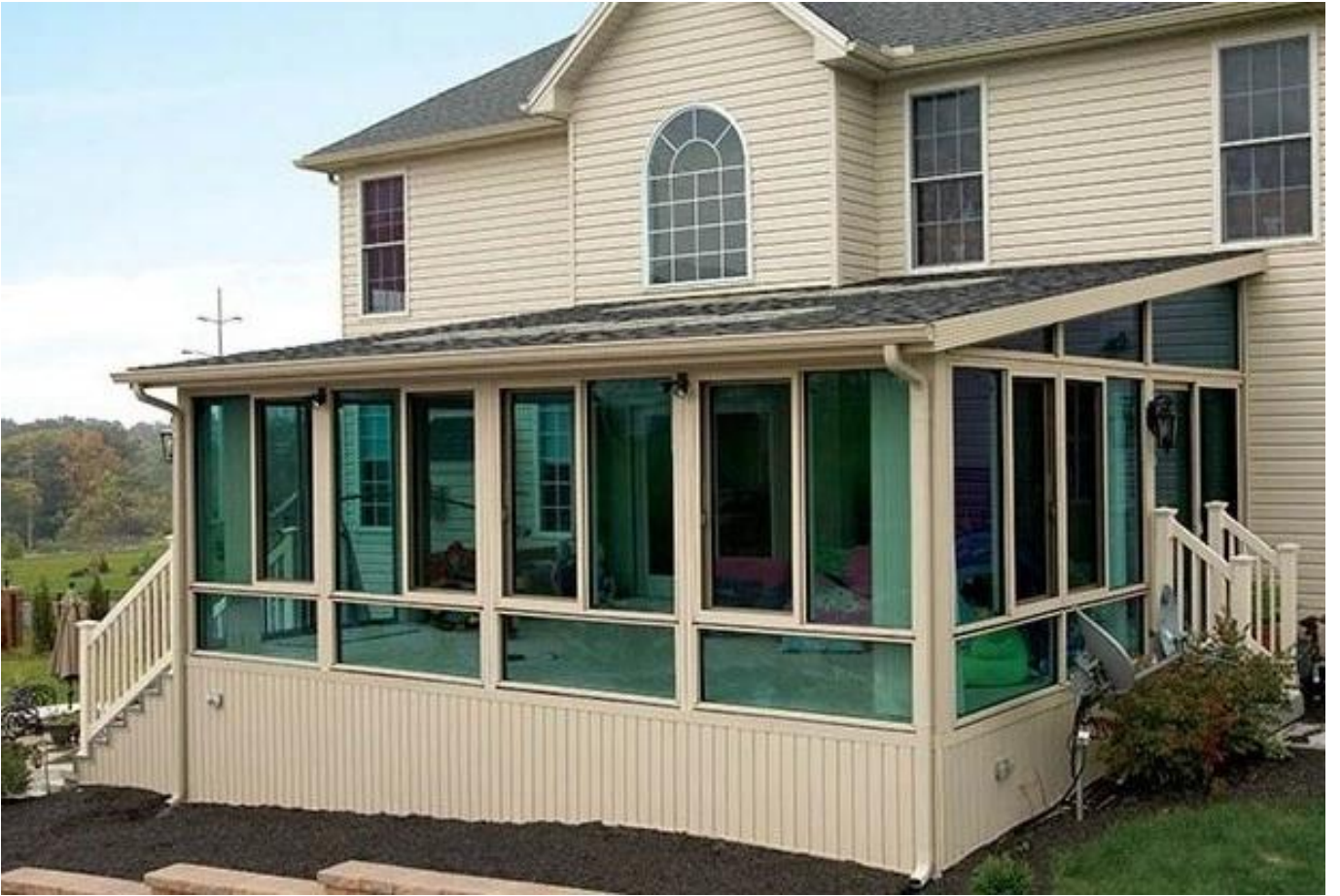
Reflective coating tempered glass panels for sunroom