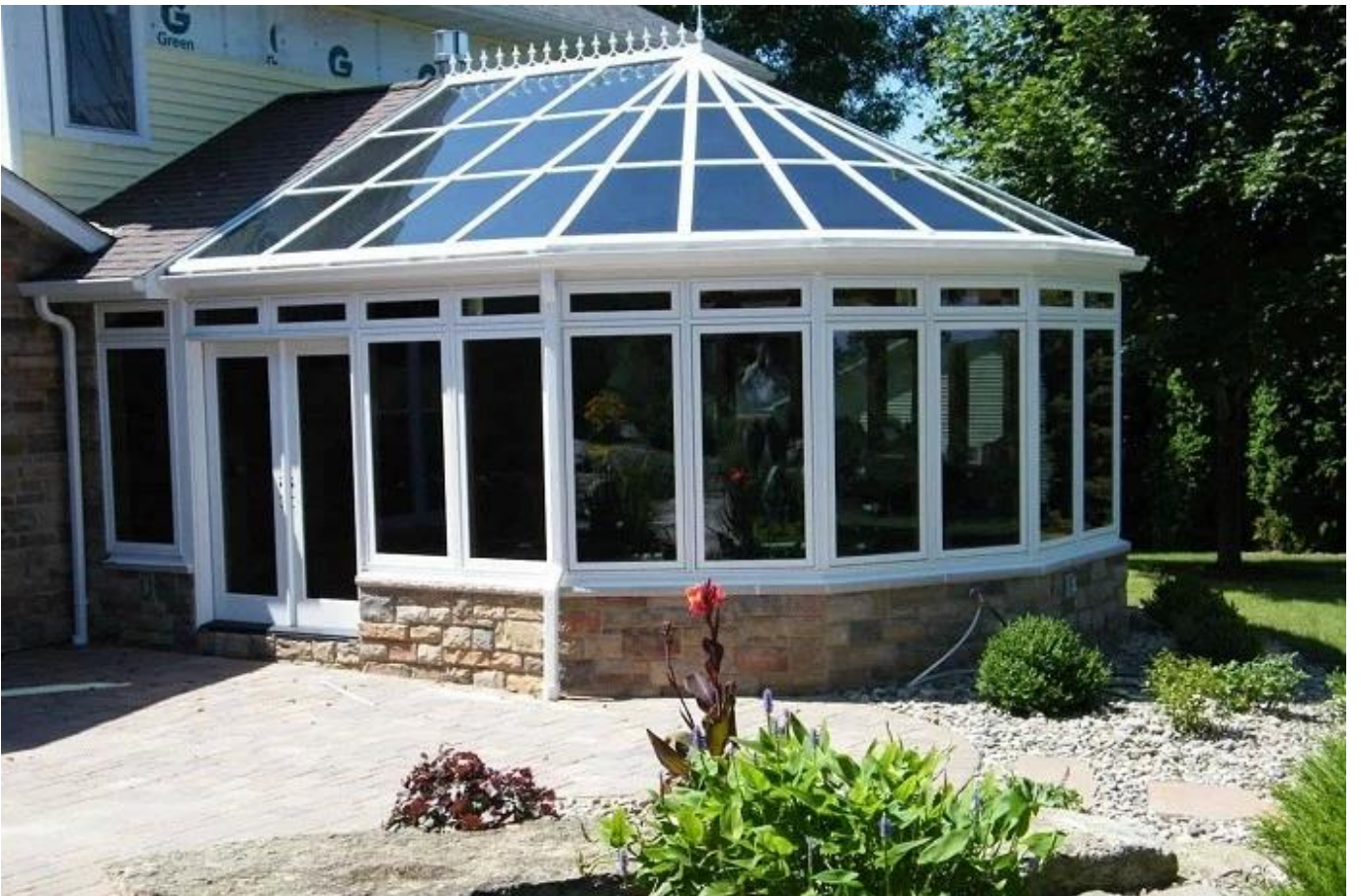
Specification of Tempered glass single panels for sunroom