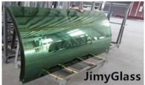
Curved glass production line