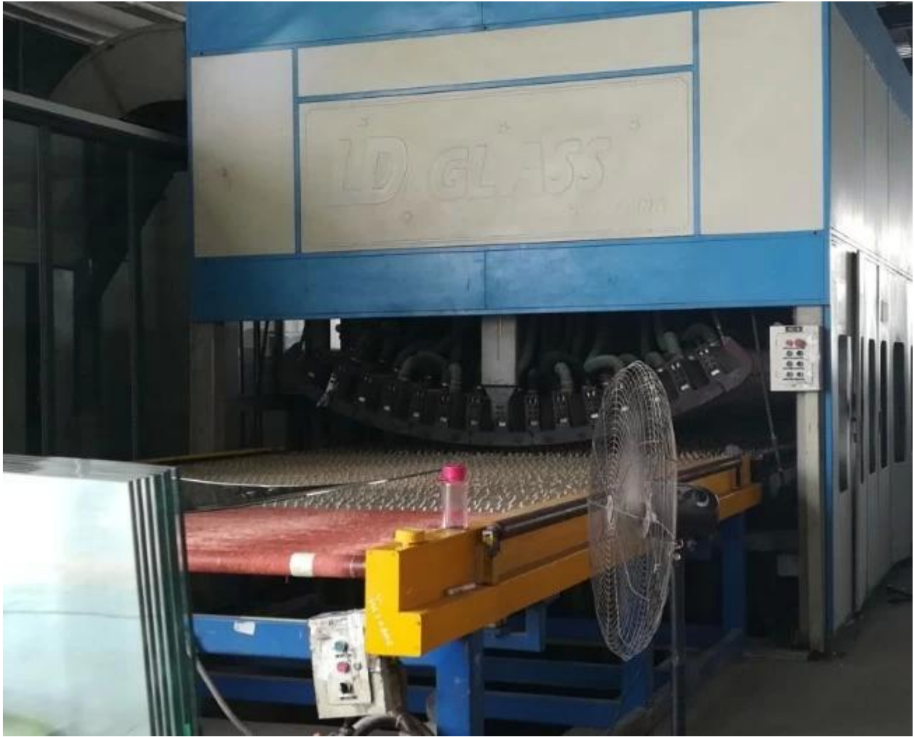
Curved toughened laminated glass factory