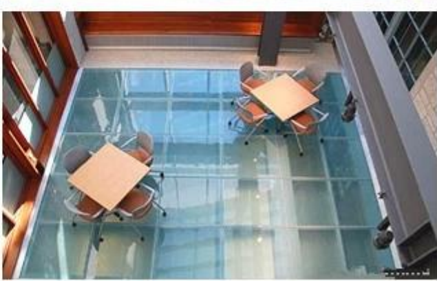
Safety floor glass factory machine: