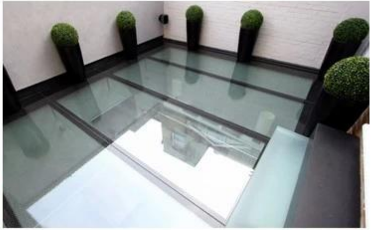
Anti-skid frosted glass floor application: