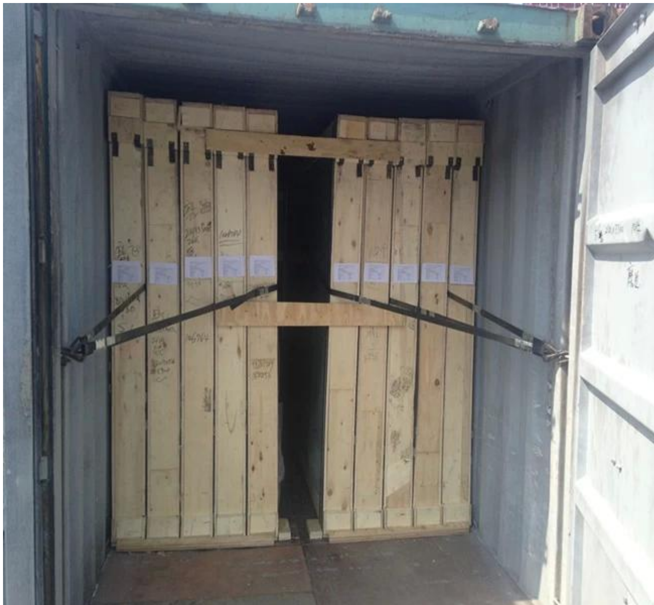
Factory show of blue color glass