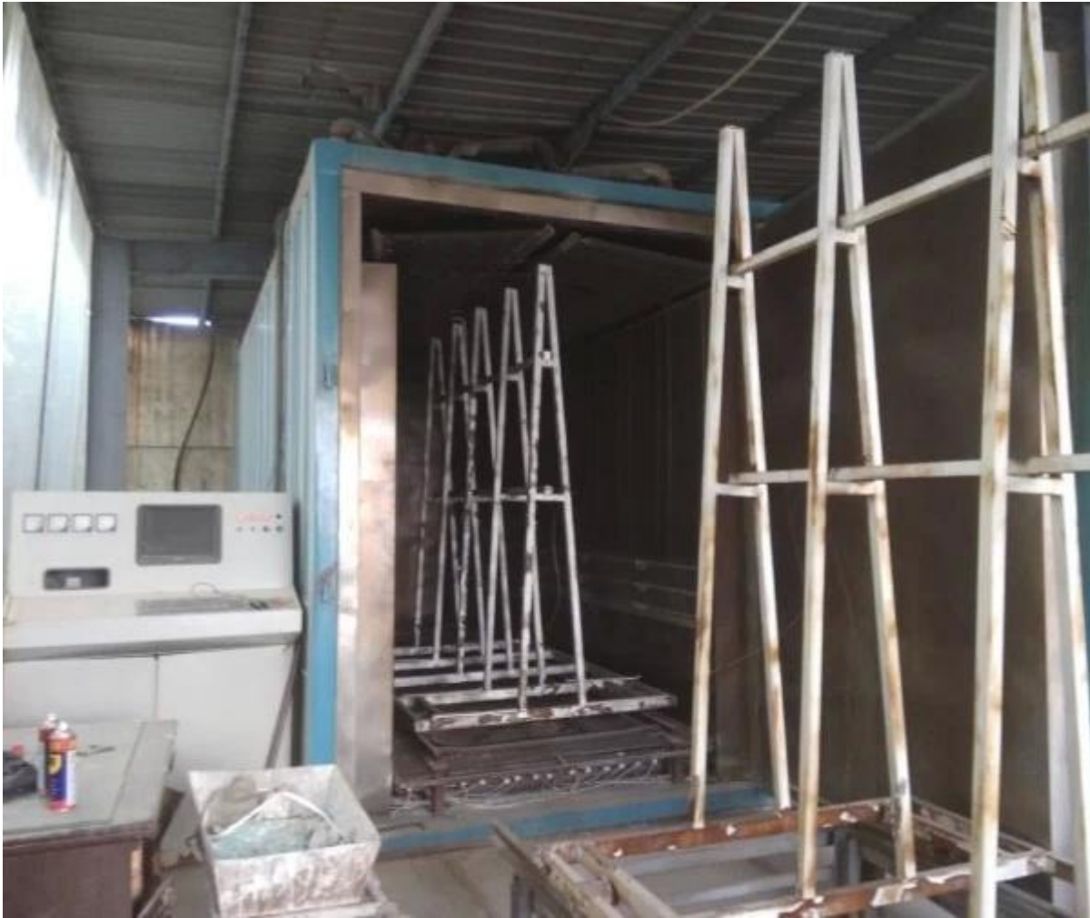
High quality Heat Soaked Tempered Glass