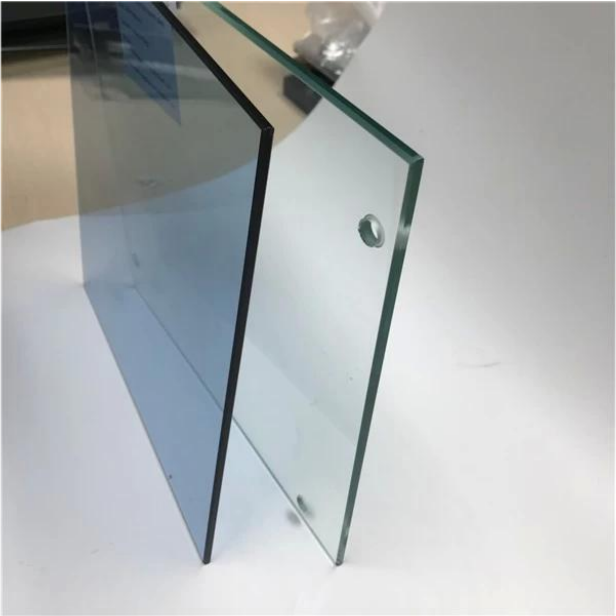
Ultra clear tempered heat soaked glass