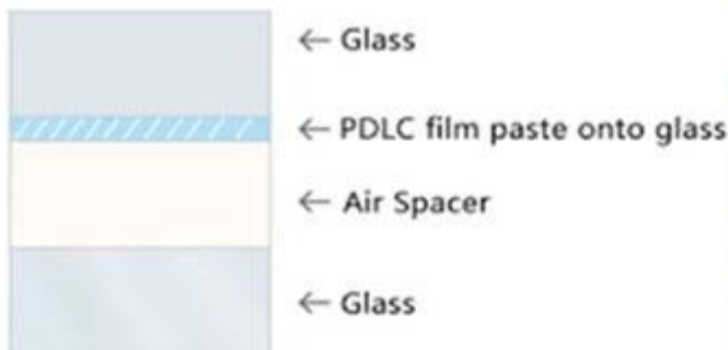
switchable IGU option A