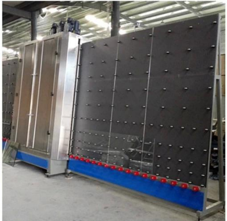
Insulated glass warehouse