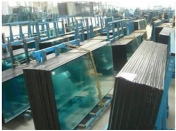
Tempered-laminated-reflective insulated glass :