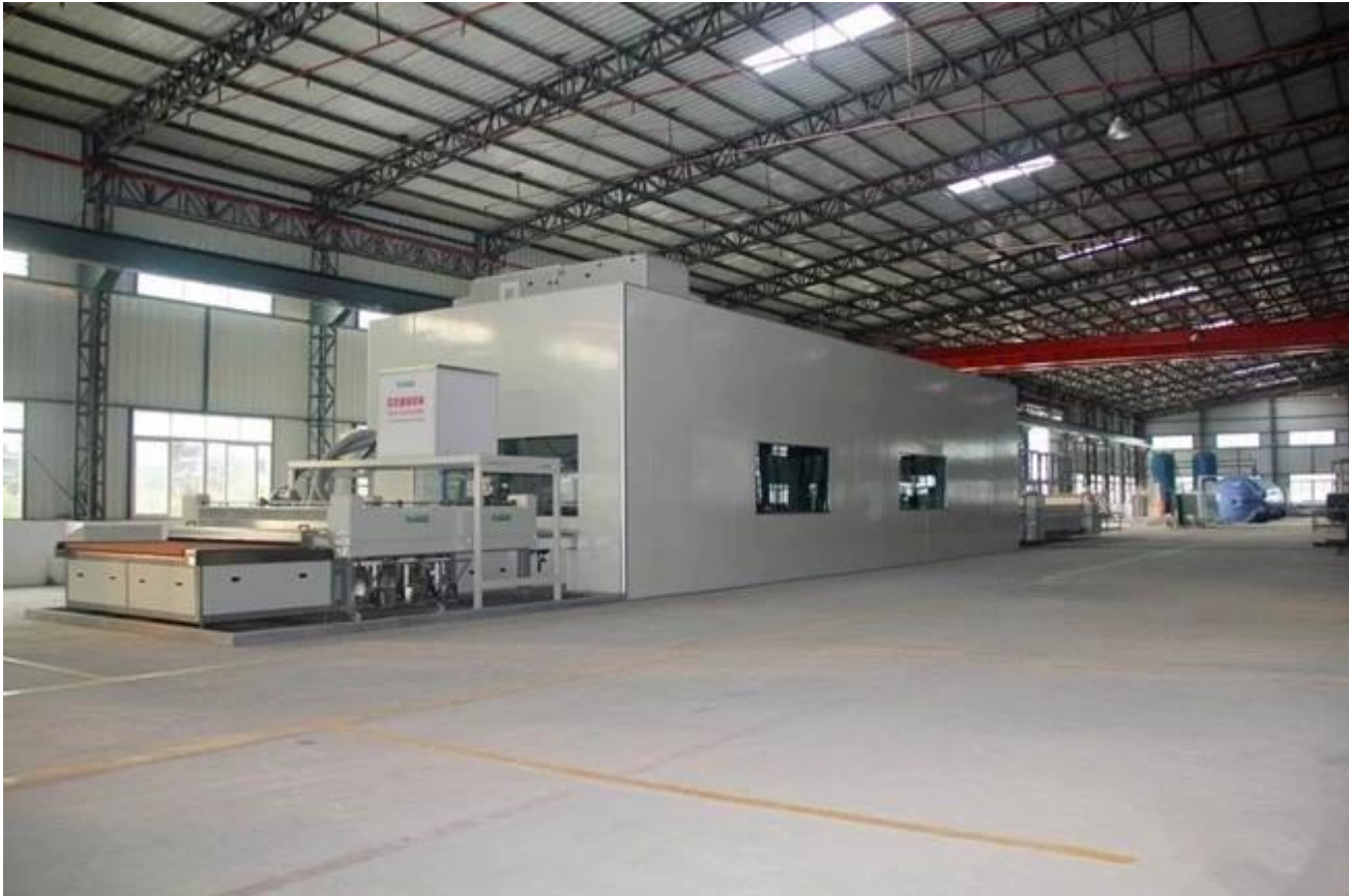
Laminated Glass Safety Packing