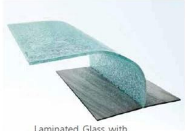
Laminated Glass with PVB Interlayer