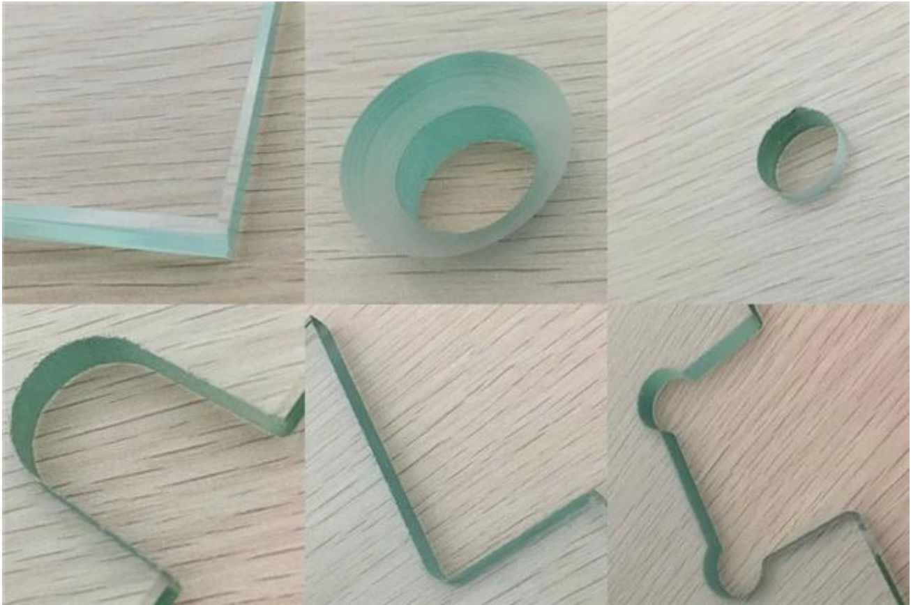
Tempered glass edge treatment and machine.