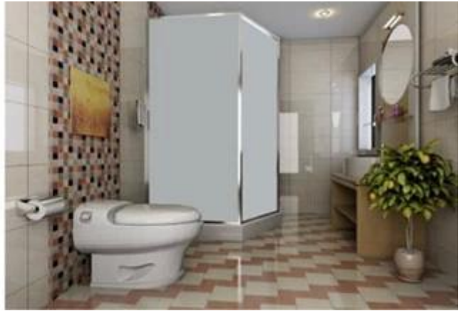
Safety smart Privacy glass for glass wall