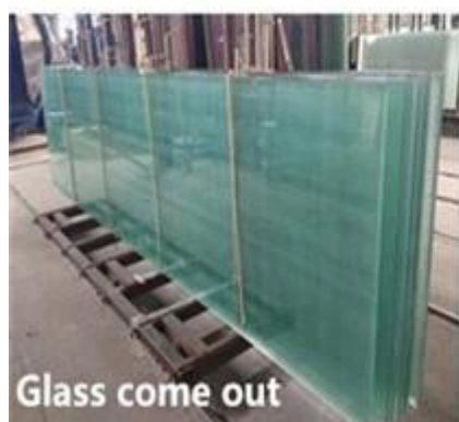
Glass come out