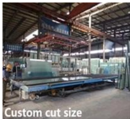
Custom cut size