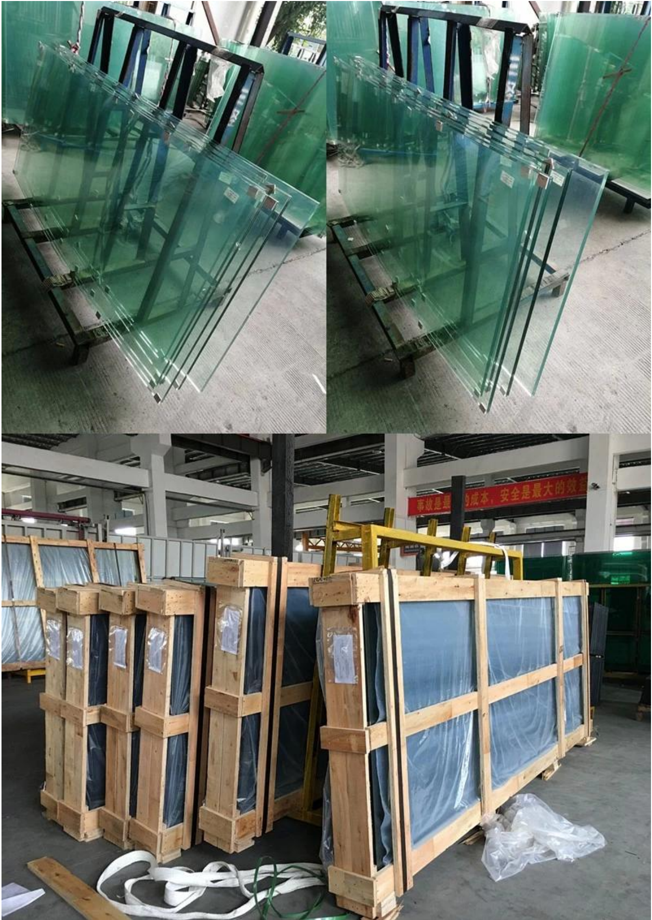
3-Right way loading and arrange excellent shipping company to ensure glass safety.