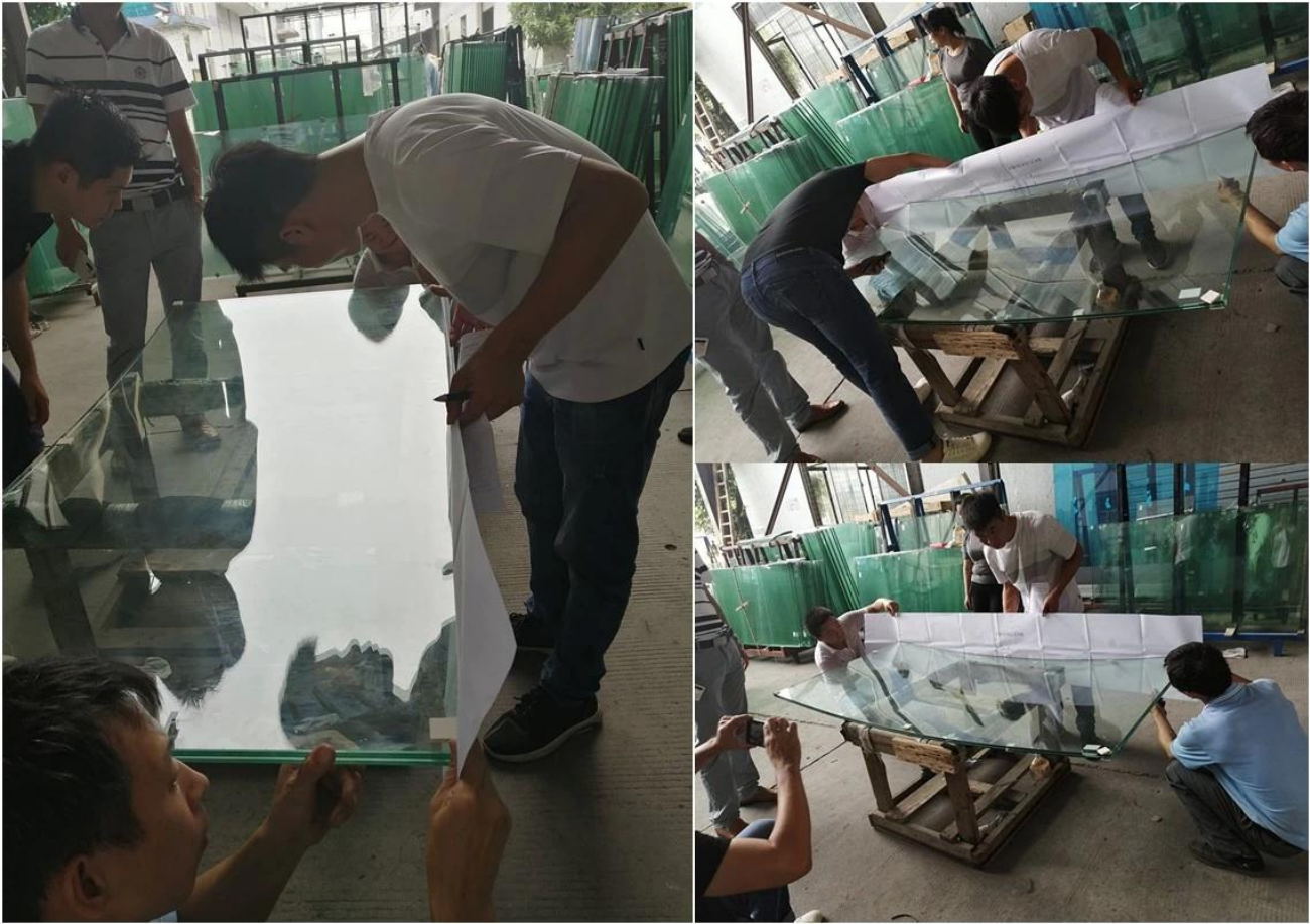
2-Delivery on time and strong plywood packaging with excellent corks or paper for separate each glass.