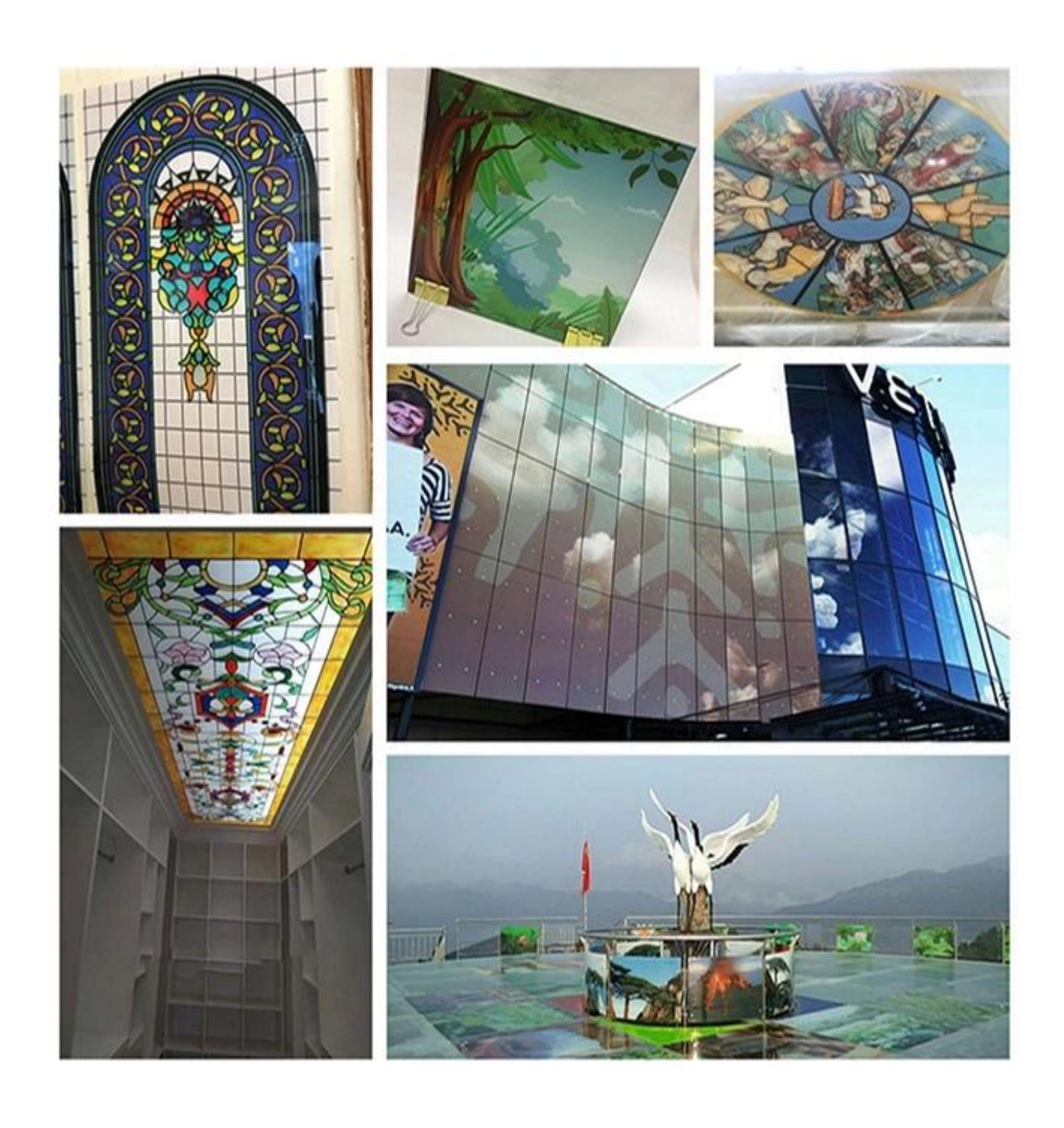
Application for Curtain walls, Partitions, Railings, Shower screens, splashback