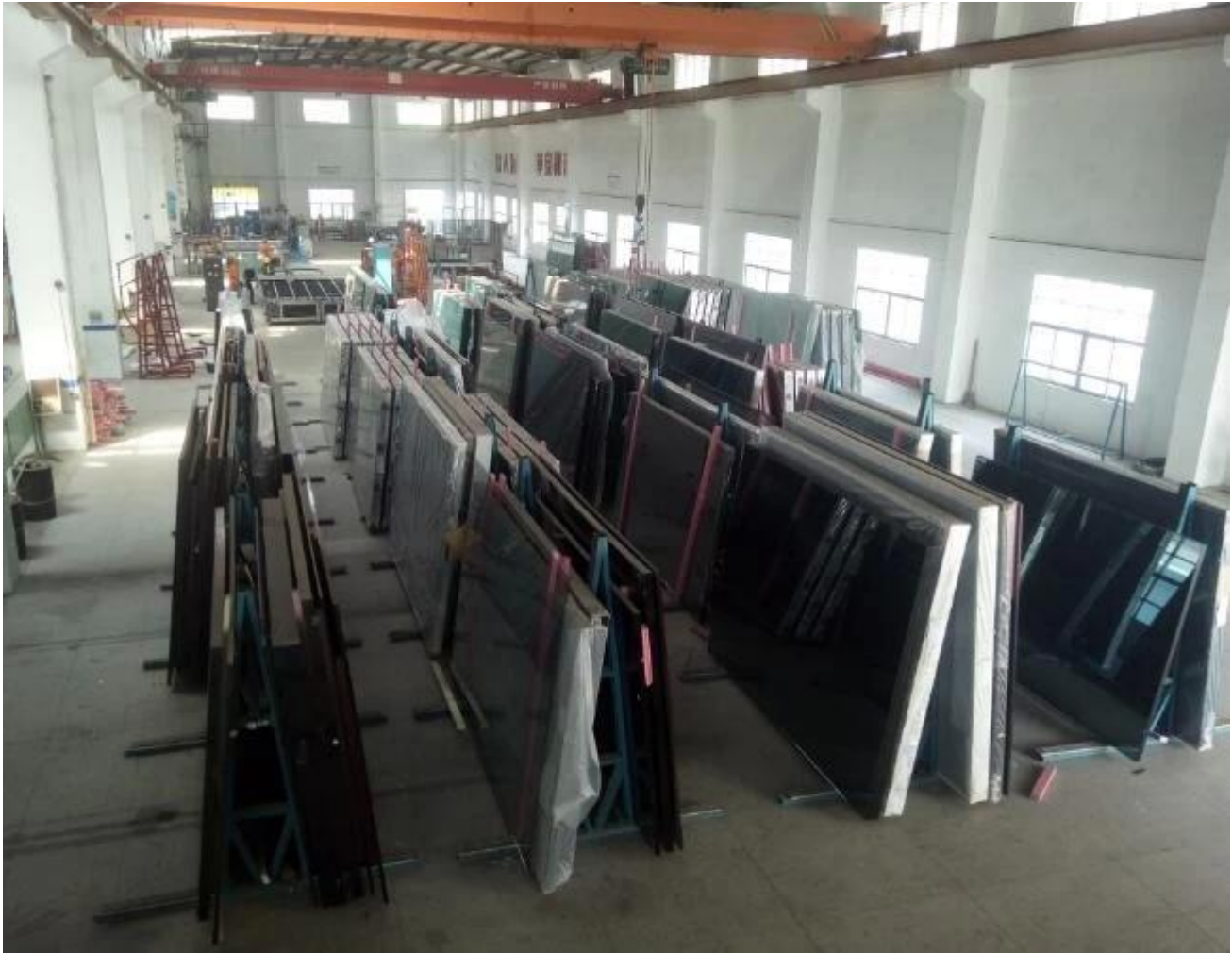
Glass packaging by JIMY GLASS