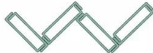
Double glazing arranged in zig-zag formation in pairs

High quality transparent U channel glass facade curtain wall