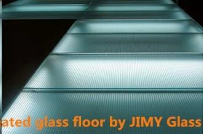
Anti-skid laminated glass floor by JIMY Glass