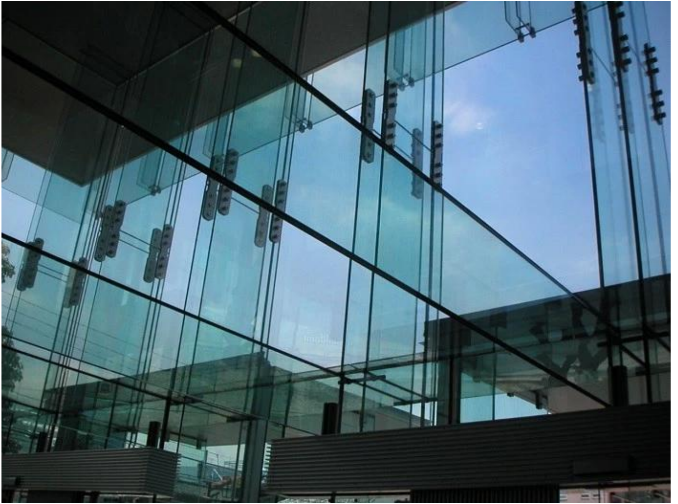
jumbo glass size PVB laminated composite glass products for facade.