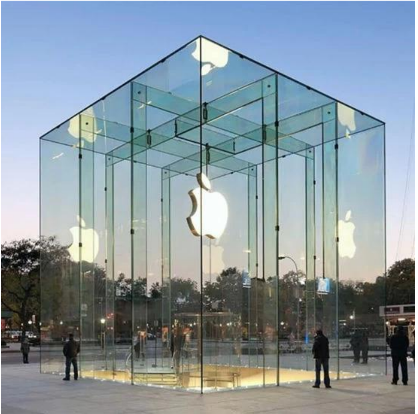
jumbo size glass --Lobby glass with height over 6 meters.