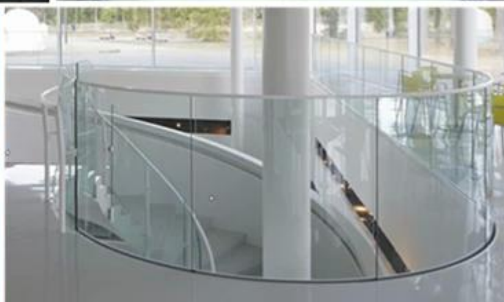
High quality safety curved ESG glass panel