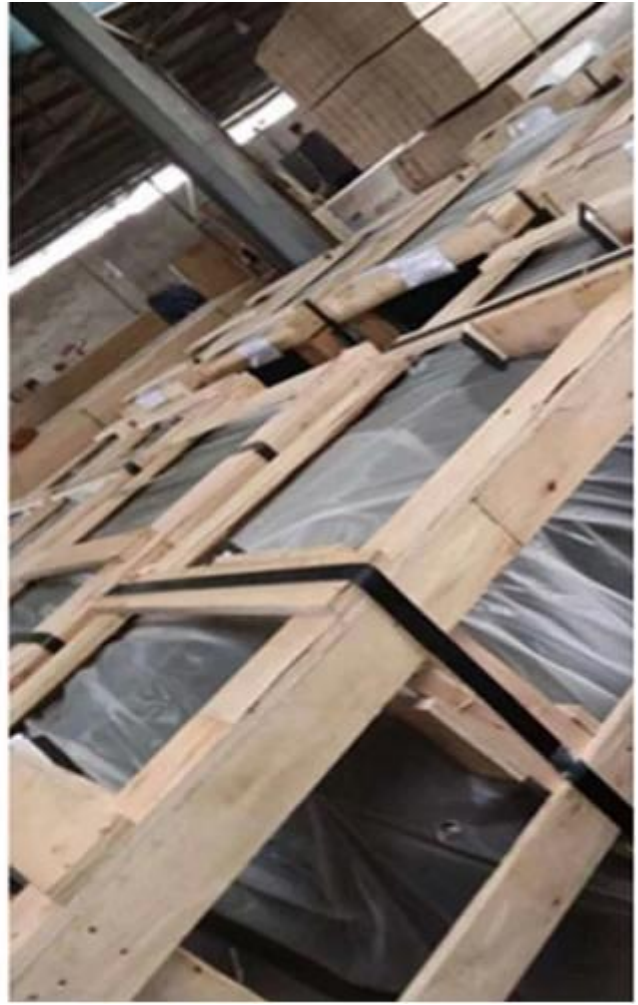
packing curved tempered glass