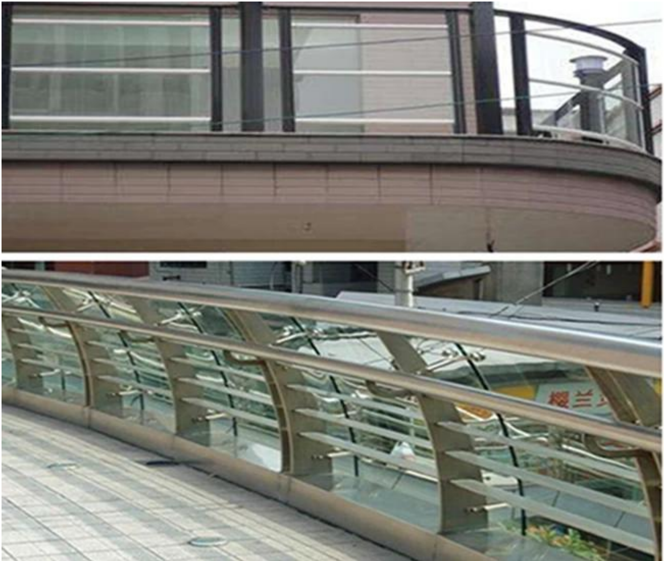
curved tempered glass production line