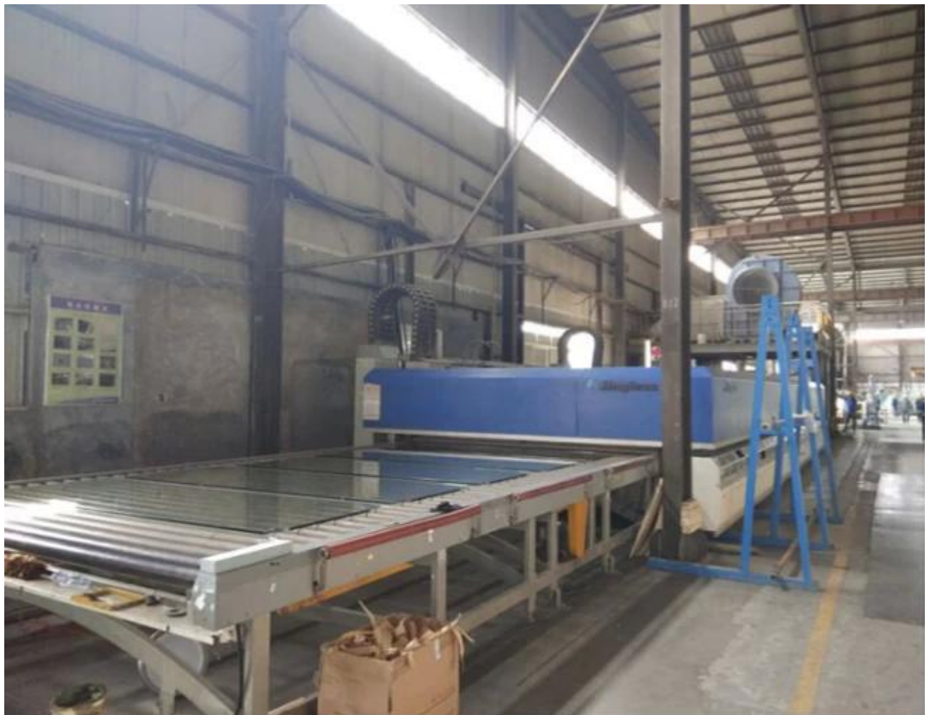
packing curved tempered glass