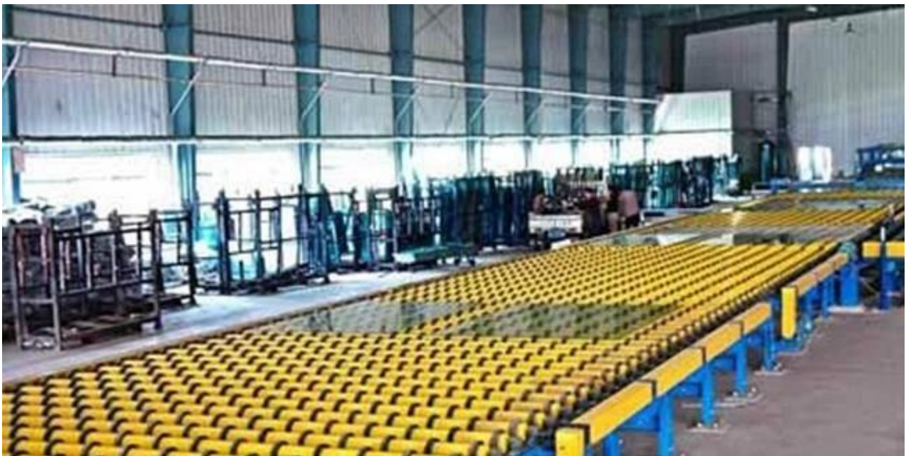
Float Glass Packaging And Warehouse: