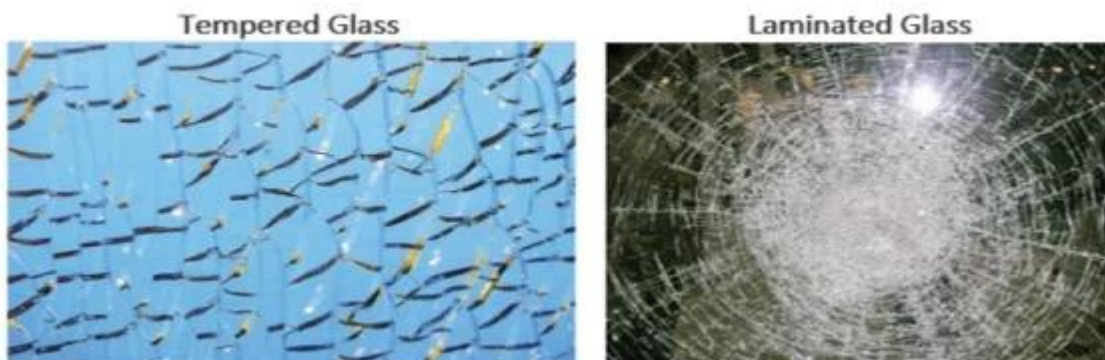
Laminated Glass Layers

Laminated glass PVB is basically a glass sandwich. It is made of two or more plies of glass with a vinyl interlayer(PVB SGP,EVA) between (sandwiched, if you will, as in a cars windshield). The glass will tend to stay together and case one in is broken -thus qualifying as a safety glazing material.