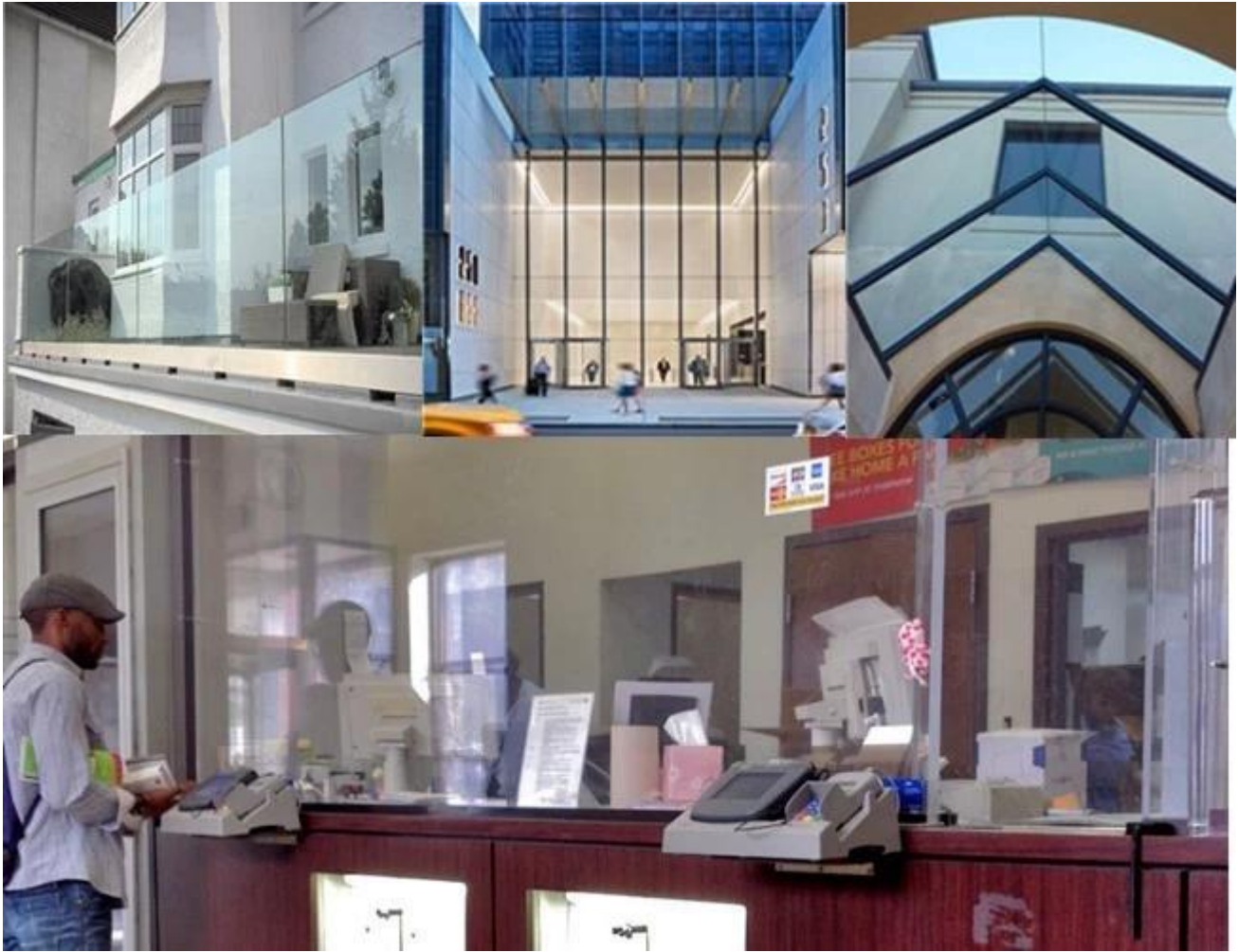
Packing of 553 clear HS laminated glass