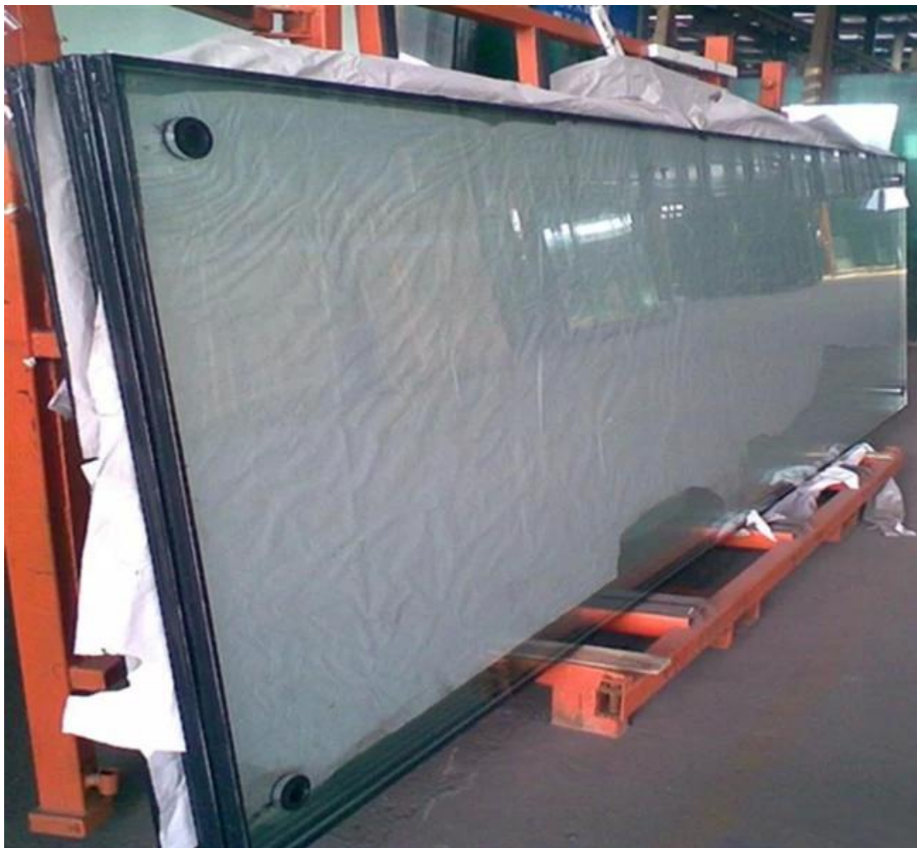
Insulated glass used for skylight: