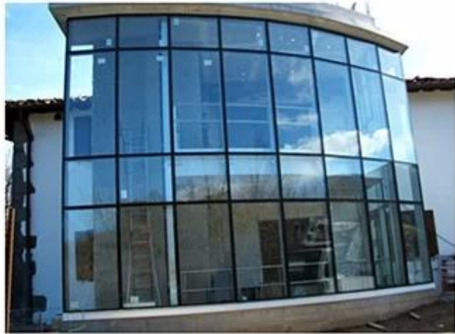
Jumbo size insulated glass and low E insulated glass in our factory.