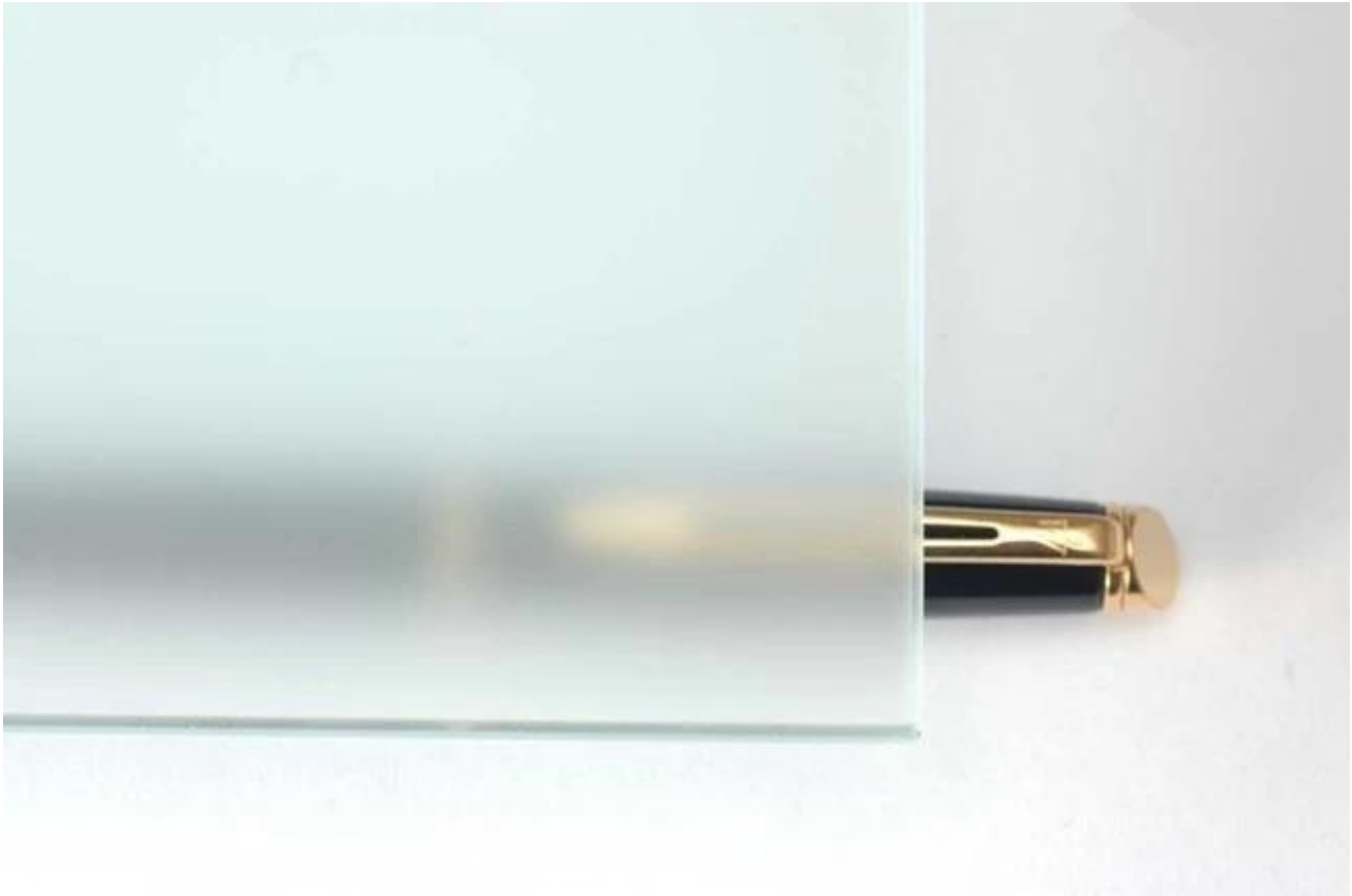
Producing line of acid etched glass