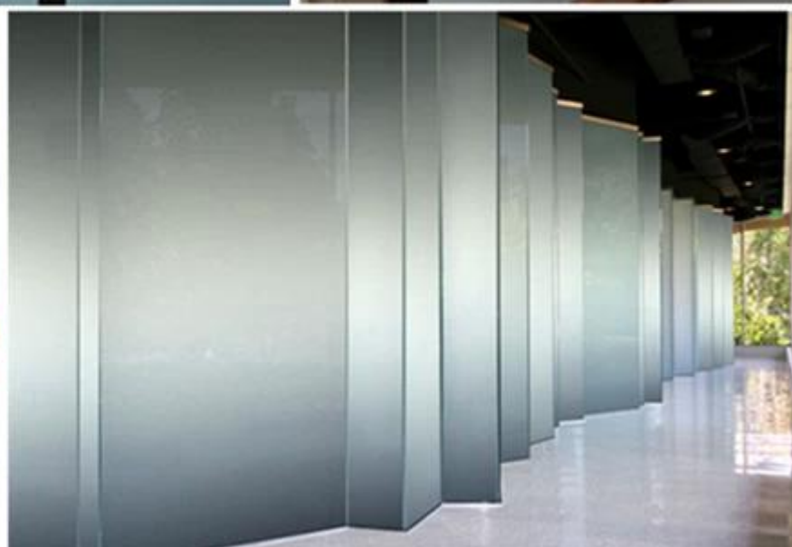
High quality 4mm acid etched glass pictures: