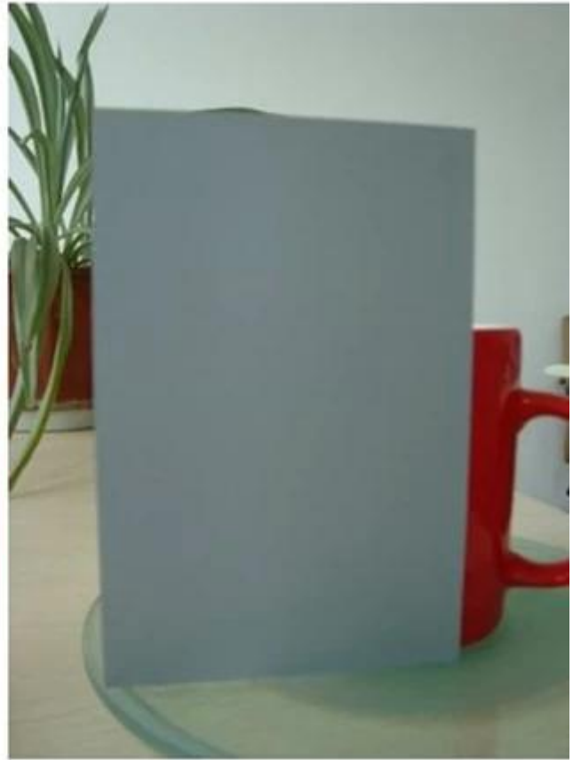
Cut to Size 4mm Copper Free Mirrors