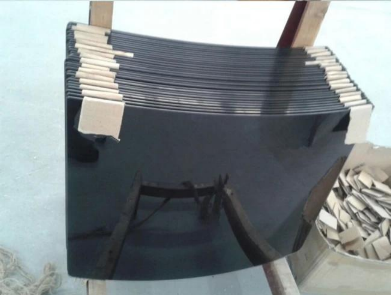
Green bending glass application: