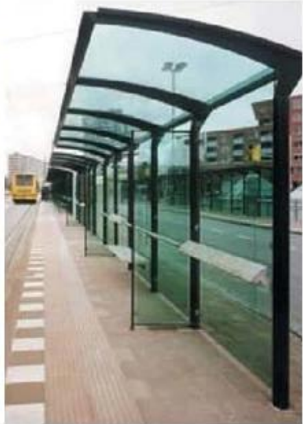
Dark green tinted tempered curved glass: